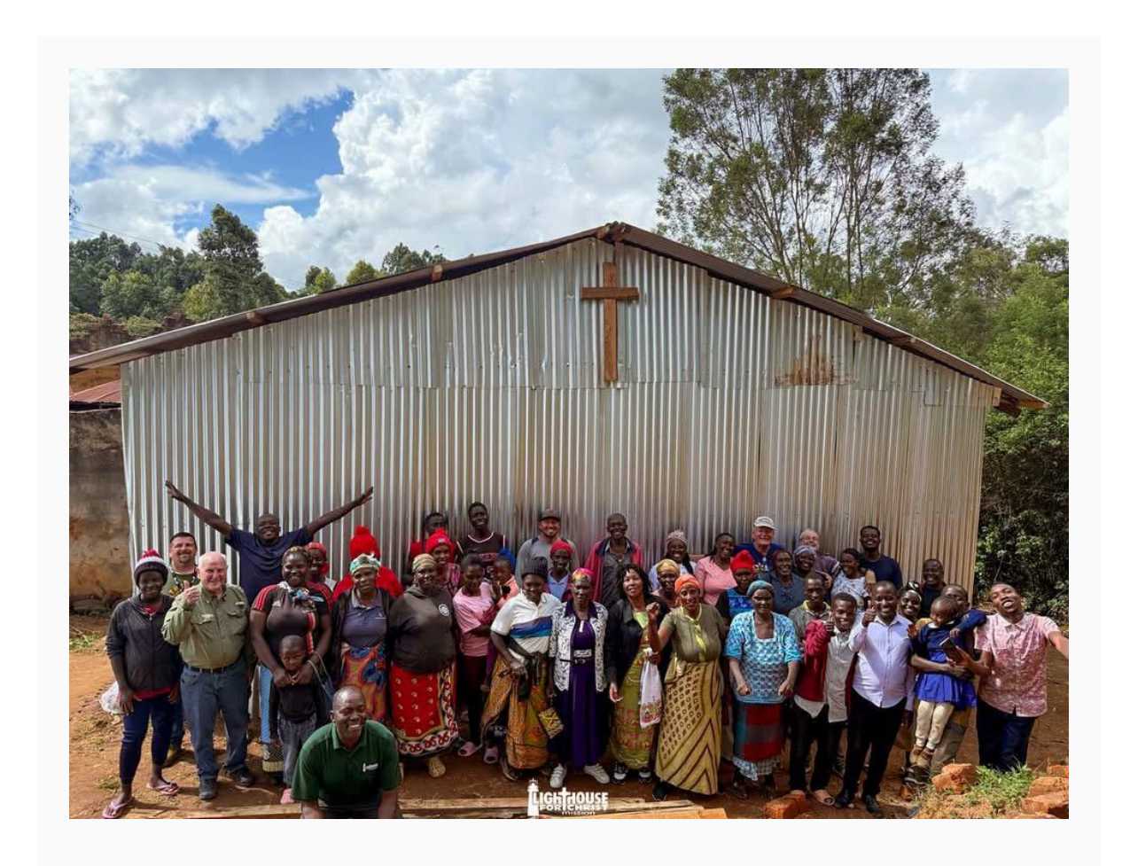
In Him, All Things Hold Together