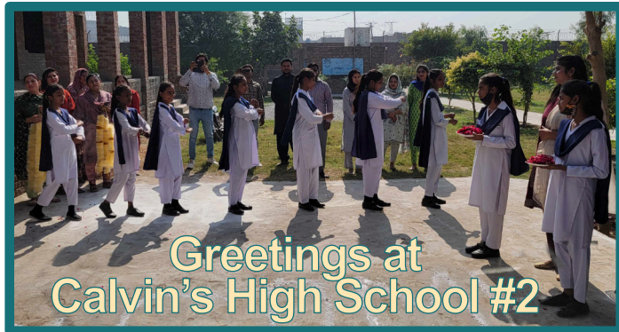
Greetings at Calvin's High School #2

As you probably know, Pakistan is a very difficult, risky, and often dangerous place to be a Christian. The Christian's life there is filled with snares and temptations. Pray for our Pakistani brothers and sisters to be given strong faith to withstand the fiery darts of the