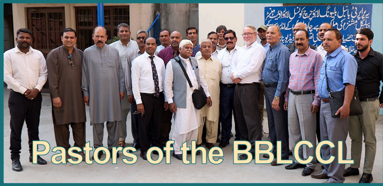
Pastors of the BBLCCCL

of witnesses, let us lay aside every weight, and the sin which so easily ensnares us, and let us